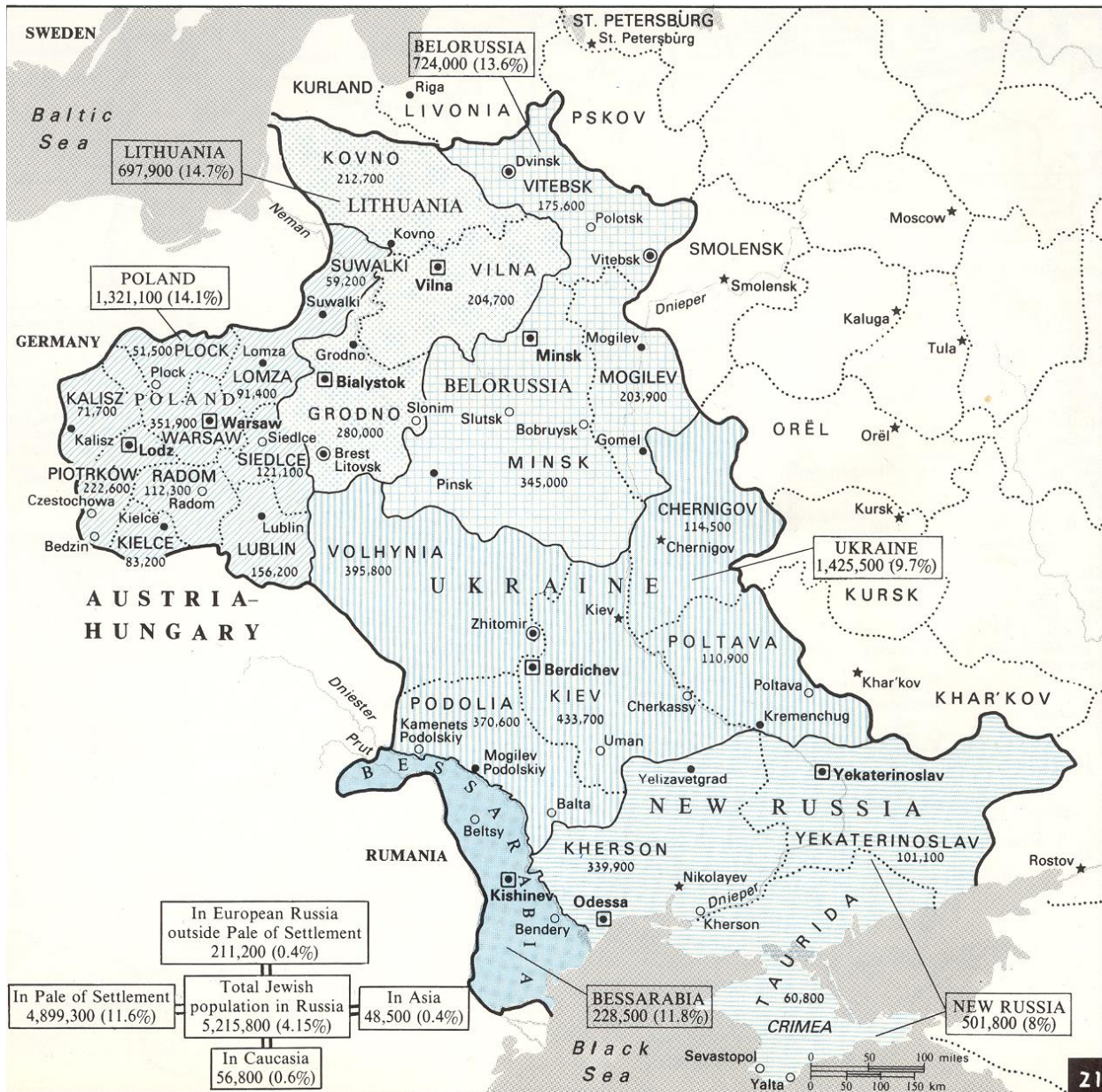
Map source: Atlas of Modern Jewish History by Evyatar Friesel

From the 1790s until World War I, Jews in the Russian Empire were for the most part restricted to Poland and the Pale of Jewish Settlement. The Pale consisted of the Vice regencies of Belorussia, Bessarabia, Lithuania, New Russia, and Ukraine. Poland was a separate entity which was merged into the Pale by the early 1870s. Each vice regency was composed of one or more guberniyas.